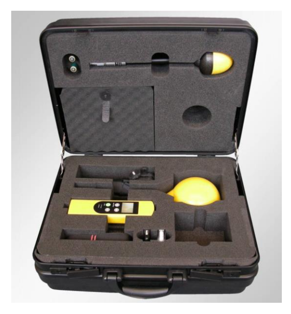
A rugged transport case is included. This provides ideal protection for the instrument, together with up to two probes and all accessories.