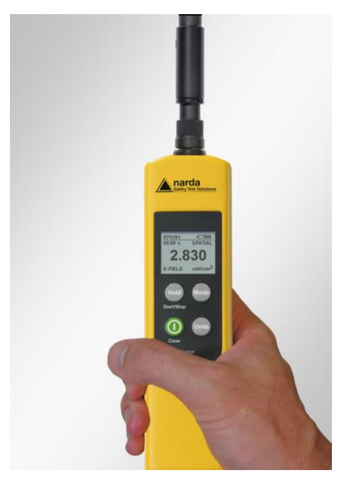
Small, lightweight and rugged design – ideal for use in rough environments