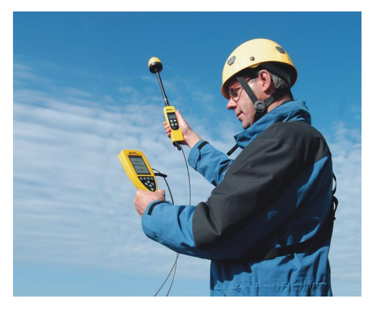
Probe extension using an optical cable: The NBM-550 acts as controller and displays the results. The smaller NBM-520 acts as the optical probe interface. Both devices can also be used separately as measuring devices when fitted with probes.