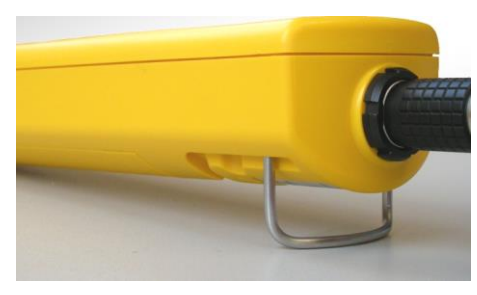
The optical interface connector and AC adapter / charger connector compartment is sealed with a rubber cap. The tilt stand provided in addition to the tripod bush can be used to place the instrument securely on a flat surface.