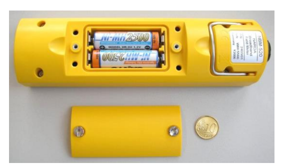
The battery compartment is opened easily using a coin. Two replaceable NiMH rechargeable batteries (AA size) are used to power the device.