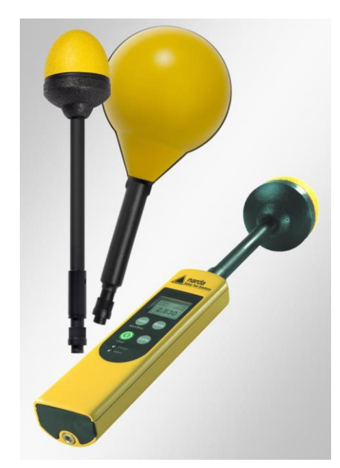
Changing the probe is quick and easy, with no need to reconfigure the device